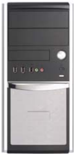
PC31031 mATX Tower