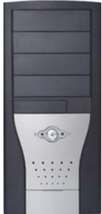
PC61122 ATX Midtower

Experience power and performance at a great price point! Touch Multimedia Systems are packed with AMD multi-core desktop processor, graphics, multimedia and storage technologies to optimize your computing experience. Touch Multimedia Systems are CSA certified to comply with Canadian consumer safety regulations and backed by a solid Touch 3-Year Limited Warranty.