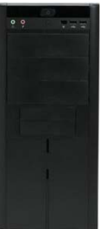
PA4206 ATX Midtower