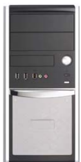
PC31031 mATX Tower