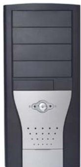
PC61122 ATX Midtower